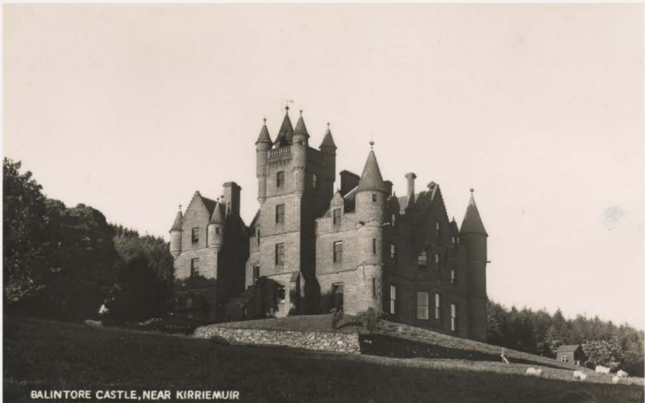
BALINTORE CASTLE, NEAR KIRRIEMUIR

GCEL GOES TO SCOTLAND, NORTHERN IRELAND, AND THE REPUBLIC OF IRELAND